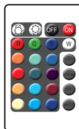
Remote Control supplied with S-RIB 5M 5W RGB